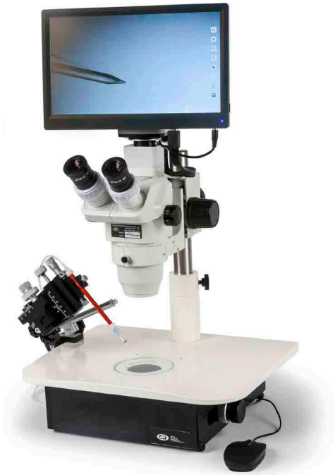
Fig. 1— A PZMIII Trinocular Stereo Microscope is mounted on the LED Illuminated Base and Articulating Mirror. The system includes a 76 mm focus mount. The optional PRO-300 HDS camera and screen are mounted on the trinocular port. An MC4 Stage Adapter (not included) is used to mount the M3301 Micromanipulator (not included) on the stage.

NOTES and TIPS contain helpful information.