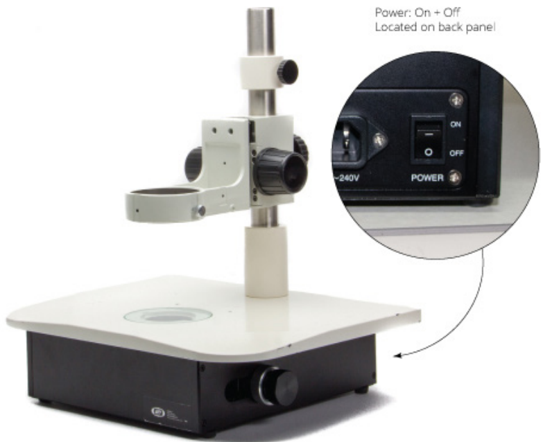
Fig. 7—The power button is located on back panel.