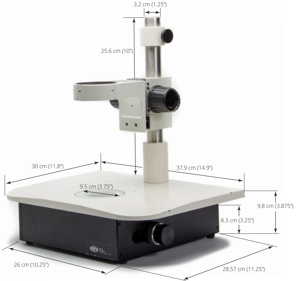
Fig. 6—The dimensions of the LED illuminated base are shown here.