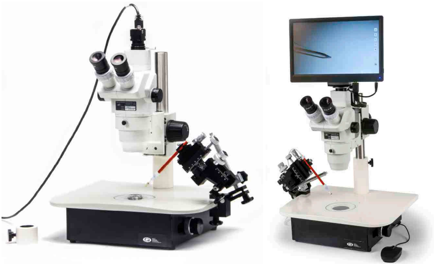
Fig. 2—(Left) A M3301 micromanipulator is shown attached to the stage platform using an M4C stage adapter. It also has a trinocular PZMT body with a video camera. This is perfect for microinjection studies.

The stage platform is solid enough to add a stage clamp and a micromanipulator. With a trinocular microscope head (PZMTIII), you may attach a camera. A setup like this facilitates classroom or collaborative environments so everyone can see on the remote screen what the researcher is viewing through the microscope.