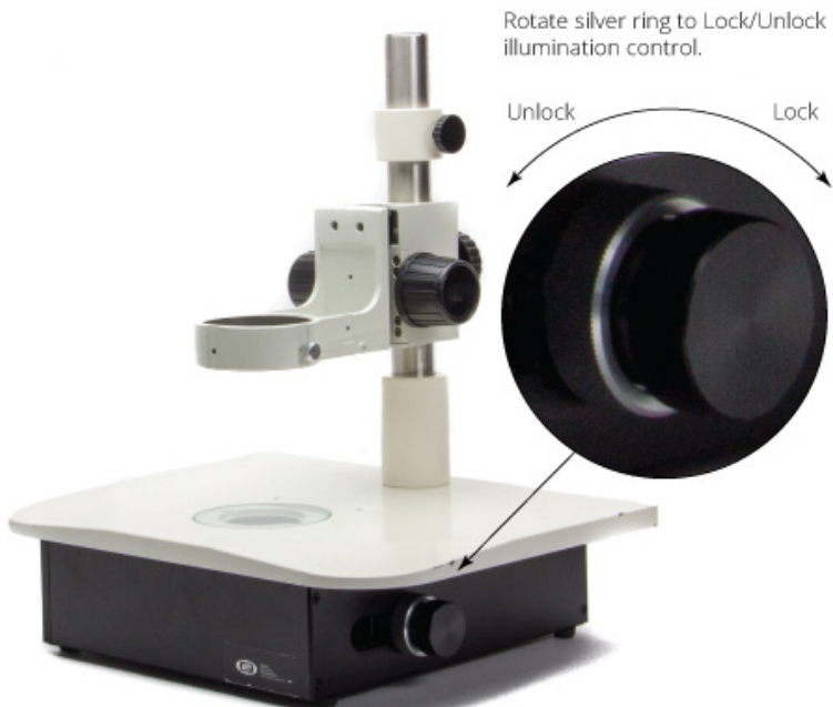
Fig. 9—Rotate the silver ring to Lock/Unlock the illumination. Rotate the illumination control (center black knob) to adjust the mirror for mirror or oblique subject illumination (dark background with subject illuminated).

There are two reflectors, one is diffuse, the other is a parabolic mirror. The brighter image will be the parabolic mirror.