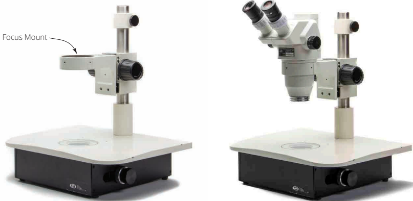
Fig. 4—The PZMIII stereo microscope head is mounted in the 502009 Focus Mount.

The LED illuminated base with articulating mirror works well with a PZMIII or PZMIV stereo microscope head, using the 502009 Universal Focus Mount (76 mm).