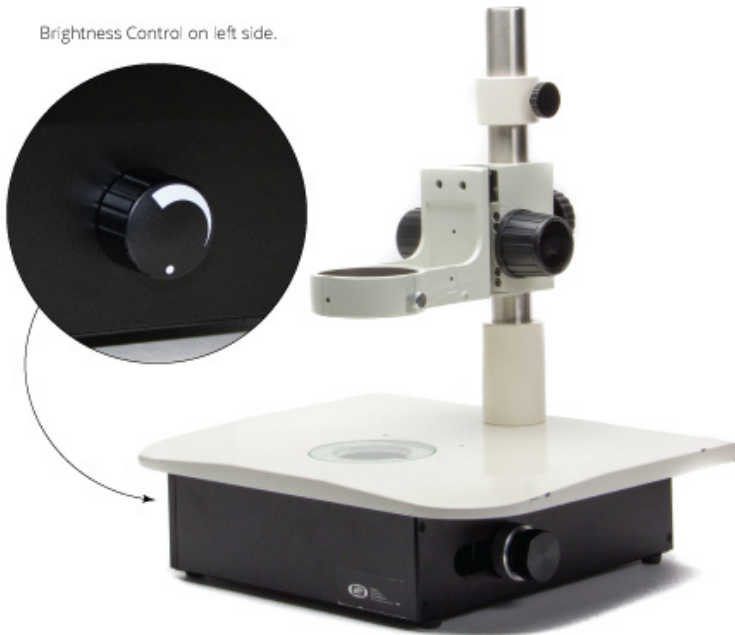
Fig. 8—The brightness control is located on left side panel.