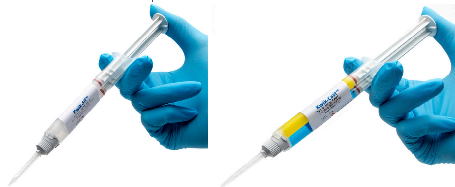
Fig. 1—KWIK-SIL (left) and KWIK-CAST (right) are packaged in an easy-to-use dual-syringe applicator which eliminates the introduction of air bubbles during mixing and causes a more consistent curing time.

NOTES and TIPS contain helpful information.