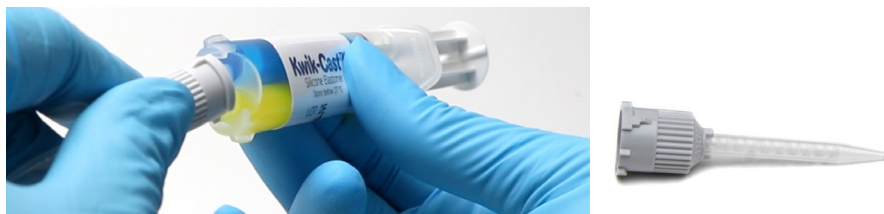
Fig. 3—Align the tip, press into place, and twist to lock it. Baffles in applicator tip ensure thorough mixing of expressed silicone.