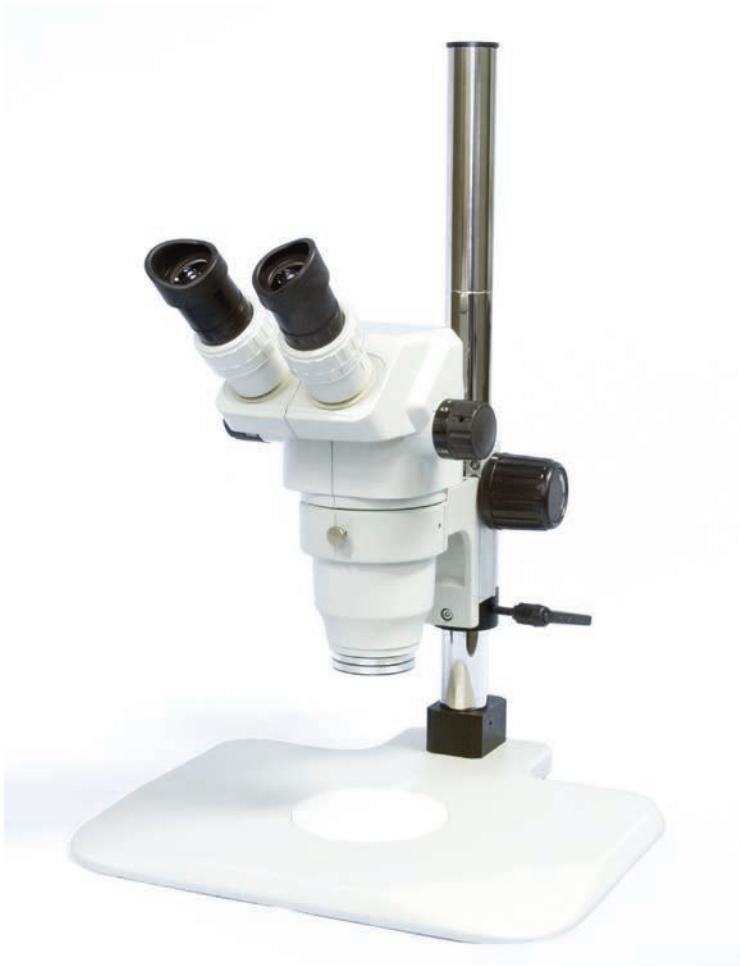
Fig. 1—The PZMIII binocular microscope is shown on its standard post stand.

NOTES and TIPS contain helpful information.