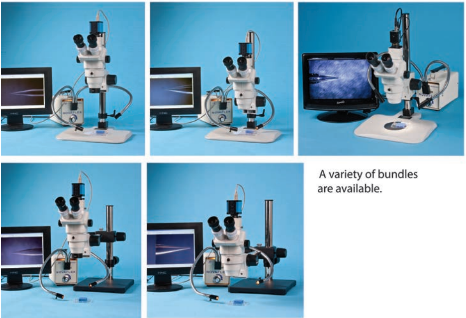
A variety of bundles are available.

When not in use, remove the eyepieces and put them back into the lens box. Replace them with the eyepiece tube dust covers. The microscope should then be secured in its box or covered with a dust cover.