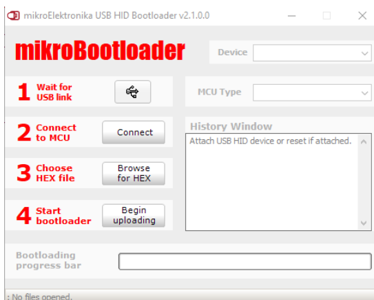
Fig. 2—The USB icon on 1 turns red when a connection is detected. Then a message displays in the History Window when it is connected. The progress bar at the bottom indicates the progress of the file upload.